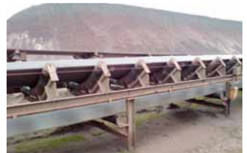
This roller bearing is overheated and should be replaced.

using thermal imaging cameras. The main advantage of thermal imaging is that you can locate mechanical and electrical problems very quickly and accurately. With thermal imaging you will be able to immediately see which component is causing the problem."