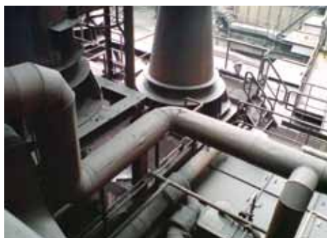
The thermal image shows faulty pipework insulation. This can disrupt the production process and cause dangerous accidents.